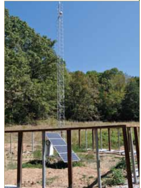
Elecam towers are solar powered and surrounded by a safety corral. Many are also outfitted with automatic waterers for the elephants.

We are thrilled to have this opportunity to take the Sanctuary to a whole new level of silent observation, care and education in a digital age—and happy that we can do all of this without intruding on the Girls as they continue to go about their daily lives grazing, napping, browsing, swimming, socializing and just being elephants. 💎