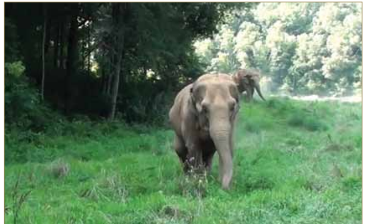
Lottie & Minnie

The cooler temperatures also mean group naps for these two. During hotter months when escaping the hot sun is a necessity, they are rarely seen napping together—Misty will be in the woods, while Dulary continues to dust herself. But with the temperature drop, they have been spotted napping side-by-side, basking in the mid-day sunlight.