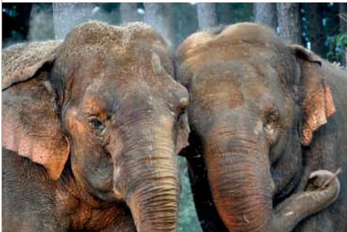
Dulary & Misty