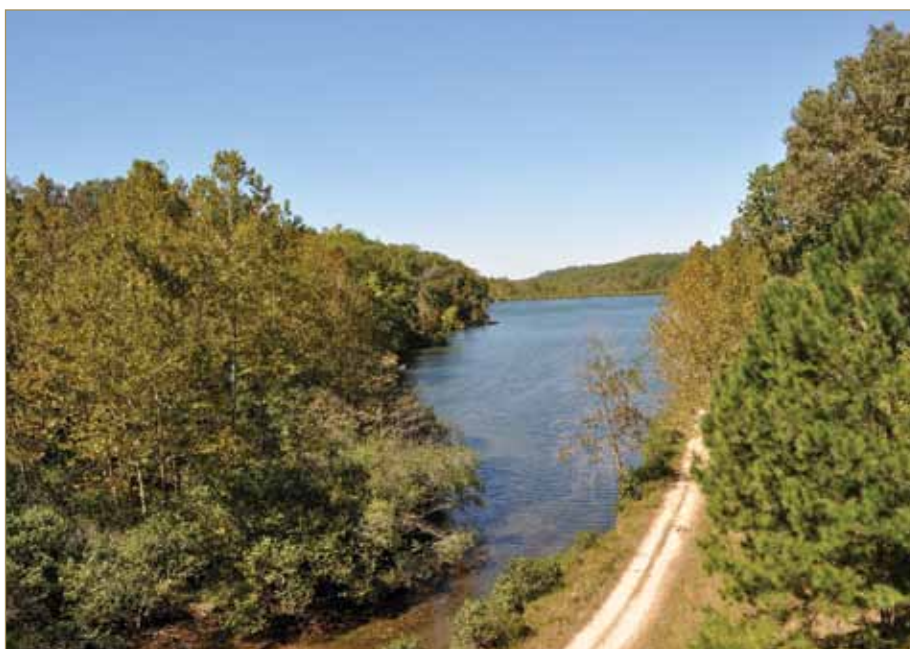
View of the lake from atop one of the new Elecam towers