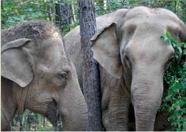
Winkie & Sissy

meadows on the north side of the property. Night feed in this area is a game of “Marco-Polo” with them. In the darkness with limited sight, which can sometimes be pitch-blackness in absence of the moon, caregivers can cheat when it comes to finding them. They have discovered if they shut off the 4-wheeler and loudly ask, “Where are you?”, inevitably they hear a forceful blow, which is Sissy’s excited response. Her answer is soon followed by some of Winkie’s “oohs” that point them like a compass in the right direction. Sissy and Winkie have been very light and vocal each morning as well, greeting their caregivers with their barrage of noises and deep Winkie rumbles; they completely embody a feeling of contentment.