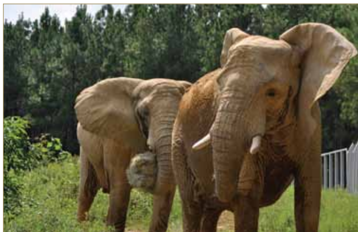
Flora & Tange

With soft, short trumpets, they still enjoy life’s simple pleasures. 💎