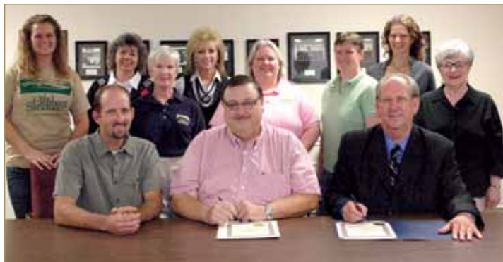
City and County Mayors also signed proclamations to kick off the month, with representatives of the city and members of Sanctuary staff present.

The official Tennessee proclamation recently signed by Gov. Phil Bredesen states, "The Elephant Sanctuary in Tennessee continually sets and reaches goals to better the lives of all elephants worldwide."