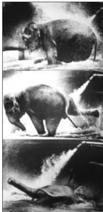
Winkie enjoys bath at the zoo