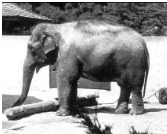
Winkie at the Henry Vilas Zoo

outward affection toward Penny, only Winkie can say how attached she was to Penny.