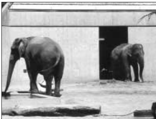
Winkie & roommate Penny at Henry Vilas Zoo

The Henry Vilas Zoo in Madison, Wisconsin, is the only home Winkie has known in captivity. She has shared her small zoo space since infancy with others who have come and gone. Rasha, a young elephant who resided at the zoo for a short time, actually left and then returned, only to leave again. This may have confused Winkie but gave her hope that when others left, perhaps they, too, would return. Rasha did not. She was sold to a small city owned zoo in southern Wisconsin where she spent 13 years alone. Finally, Rasha was moved to a larger institution that housed other Asian elephants. Time passed and Winkie settled in with her remaining roommate, an African elephant named Penny. Penny was her junior and appeared to solicit Winkie's attention. Even though Winkie exhibited few signs of