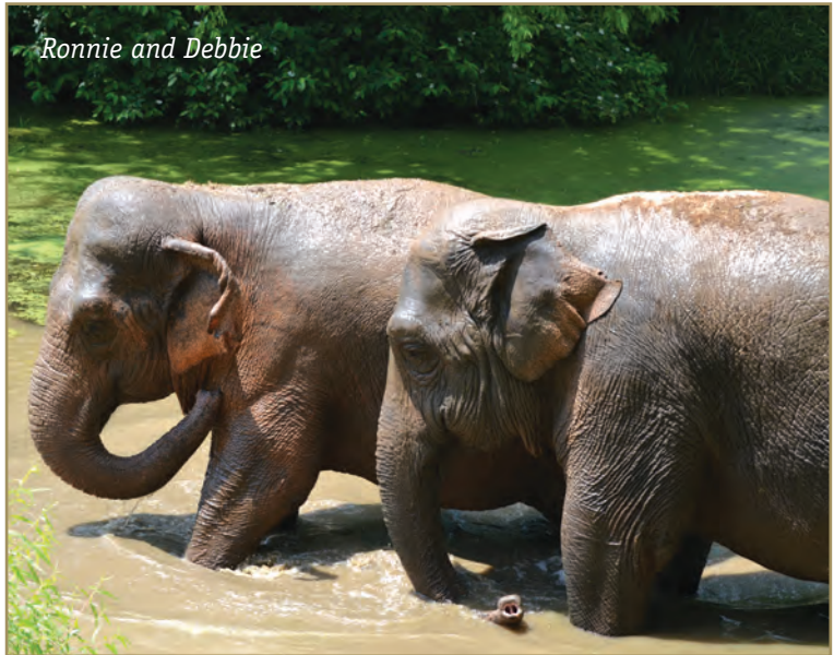
Ronnie and Debbie